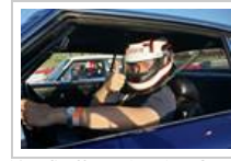
NOVA: Making Stuff- Wednesday, October 16 @8pm