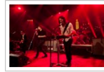
Austin City Limits: Phoenix-Saturday, October 12 @10pm