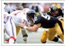
Frontline: League of Denial The NFL's Concussion Crisis-Tuesday, October 8 @8pm