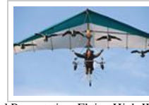
Earthflight a Nature Special Presentation: Flying High-Wednesday, October 9 @7pm