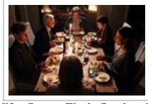
Last Tango in Halifax Season Finale-Sunday, October 13 @7pm