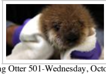
Nature: Saving Otter 501-Wednesday, October 16 @7pm