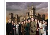
Masterpiece Classic: Downton Abbey Season 2 Premiere-Sunday, October 13 @9pm