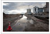
NOVA: Megastorm Aftermath-Wednesday, October 9 @8pm